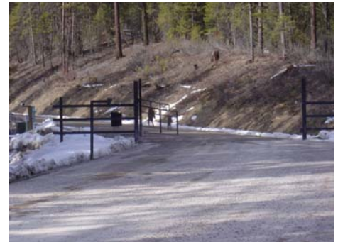
Gate on Skyles Lake Lane