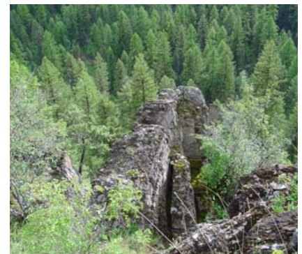
Rock outcropping in Lion Mountain

From the Lion Mountain trailhead, the main corridor will generally go west along the south part of the subarea to a bench where there are views of the Skyles Lake and Spencer Mountain subareas. From this point, a newly constructed trail will switchback a short way to the north portion of the subarea where it will continue west and descend down Lion Mountain to connect with the trail system in Skyles Lake.