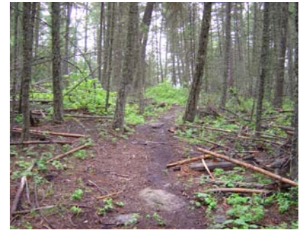
Existing trail in Lion Mountain