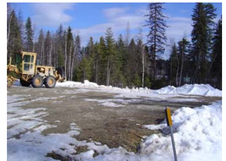
Skyles Lake subarea parking area

The main corridor will begin at the south end of this sub-unit at US 93. It is proposed that a pedestrian underpass be constructed to connect the Skyles Lake subarea to the Spencer Mountain subarea near Skyles Lake Lane. This gravel road is a private road but public access is allowed for the first one-half mile to an existing parking area located on State Trust Land. There is currently a gated road that provides access to an adjacent landowner and DNRC. In a reciprocal access agreement, there is no public motor-vehicle access north of the gate other than use by private landowners and state land-management personnel, but bicycle and pedestrian access is allowed. The trail is proposed to be re-routed and fully reconstructed off of the road through this area. This section of