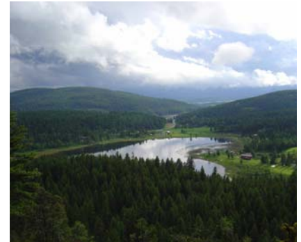
View of Skyles Lake from Lion Mountain

Lion Mountain is part of the Skyles Lake subarea. There is an informal trail network from Lion Mountain Road, which follows the ridgeline through the DNRC lands to private property. Using existing trails, a short 20 minute hike will lead to an overlook with views of Skyles Lake. This segment has some relatively steep grade but is used regularly by hikers, runners, and persons with dogs. It does not appear to have regular equestrian use. The trail network will benefit from improved drainage, erosion control, and switchback design in steep sections.