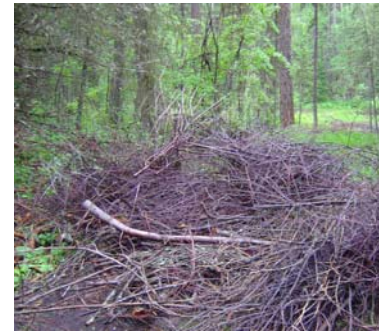
Illegal dumping of yard waste